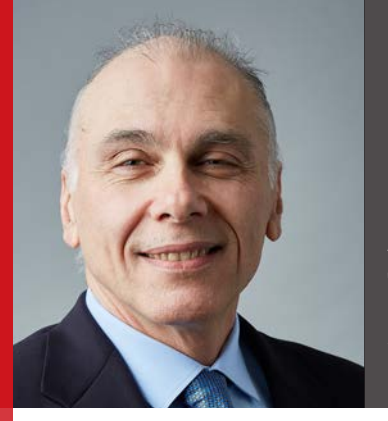
A MESSAGE TO OUR STAKEHOLDERS

ACCO Brands experienced one of its most difficult years in 2020, as the pandemic had a major effect on our consumers, employees, customers and company. But the worst is now behind us; and looking back, I'm very pleased with our actions and results. While we're still recovering, we continue to focus on the important things – keeping our employees safe, our customers supported, and our company in conformance with its obligations.