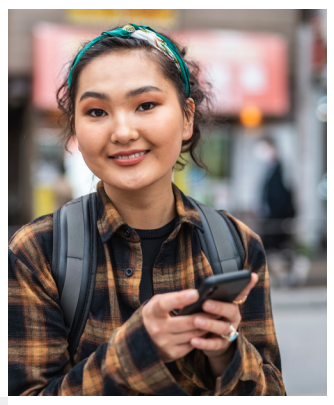
Suppliers audited achieved conformance with applicable standards on 96% of all social responsibility audit check points