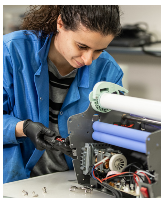
Achieved an average score of 92.7% for internal Comprehensive Environmental and Safety Management Plan audits