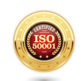
Increased the number of sites that earned the ISO 50001 Energy Management standard certification from four to nine

Suppliers completed 950+ e-learning modules on various compliance topics, such as labor, health & safety, security, and corrective action plan management