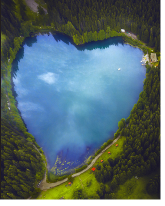
12% Reduced water consumption by 12% in those factories and warehouses reported in our 2018 ESG report