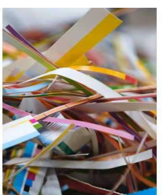
83% Recycled 83% of the non-hazardous waste in our factories and warehouses